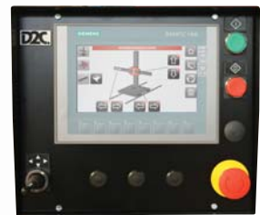
Digital controller D2C